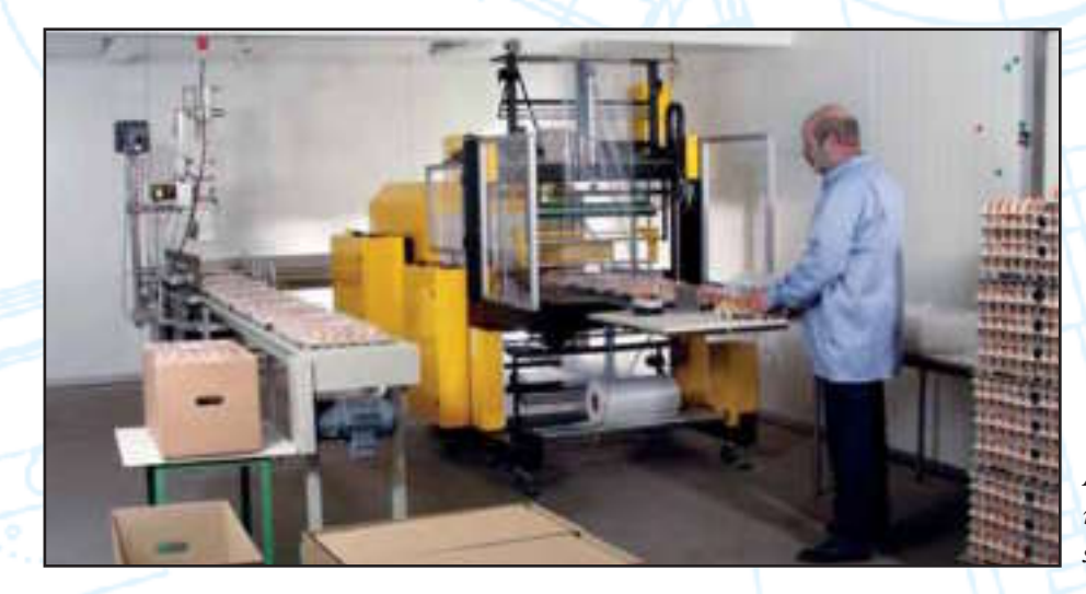
A U-shaped installation permits one-man operation in small spaces.

These machines distinguish themselves by quickly and efficiently shrink-wrapping any product imaginable. The driven feed and delivery belt of the BP-700-CVS enables this machine to be installed in a production line, thus increasing the capacity and eliminating the need for products to be lifted by personnel. This special packaging system allows you to pack products of different sizes without film changeover: small products will have smaller openings on both sides than bigger products. If the film is too narrow or too wide, feeding a different width film is only a simple operation. The film is controlled fully automatically.