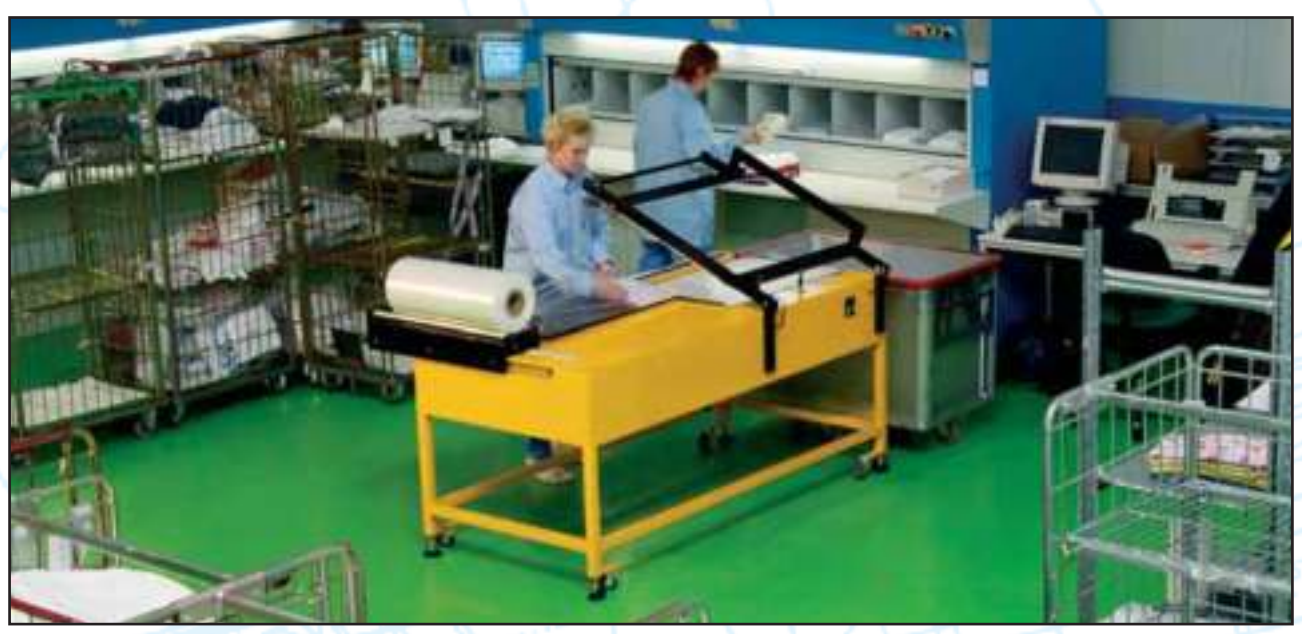
Corner sealers can be seamlessly integrated into any production process, e.g. in a laundry as illustrated here.